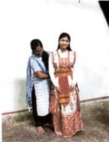
Full Costume of Chali Dress