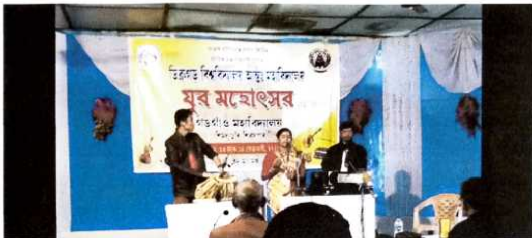
Cultural Program : Singing