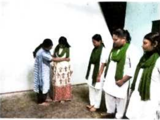
Chali Dress Ghur