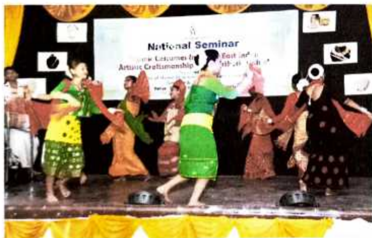
SEVEN SISTER FOLK DANCE