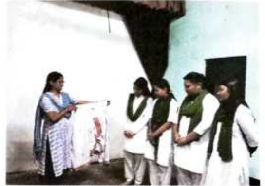
Jhumura dress Dhoti