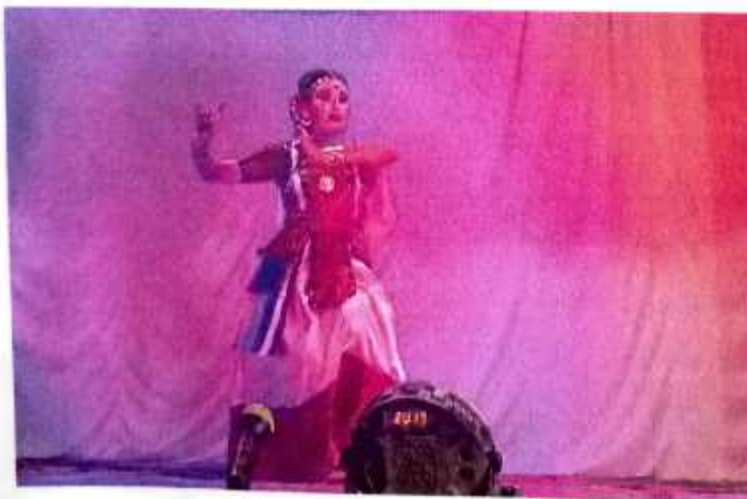
Sattriya Dance Krishna Bandana

Principal PRINCIPAL DULIAJAN GIRLS' COLLEGE P.O. DULIAJAN