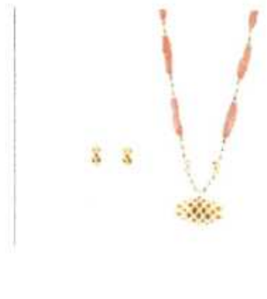
Dhoolbiri ( Ornament)