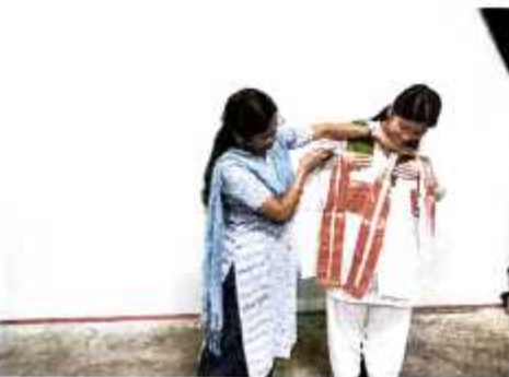
Costume of Jhumura