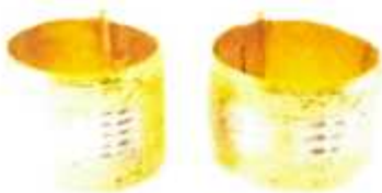
Muthi Kharu (ornament)