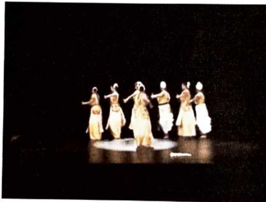
Ukha-Aniruddha Abhinoy ( Sattriya Dance)

[Signature] PRINCIPAL DULAJAN GIRLS' COLLEGE P.O. DULAJAN