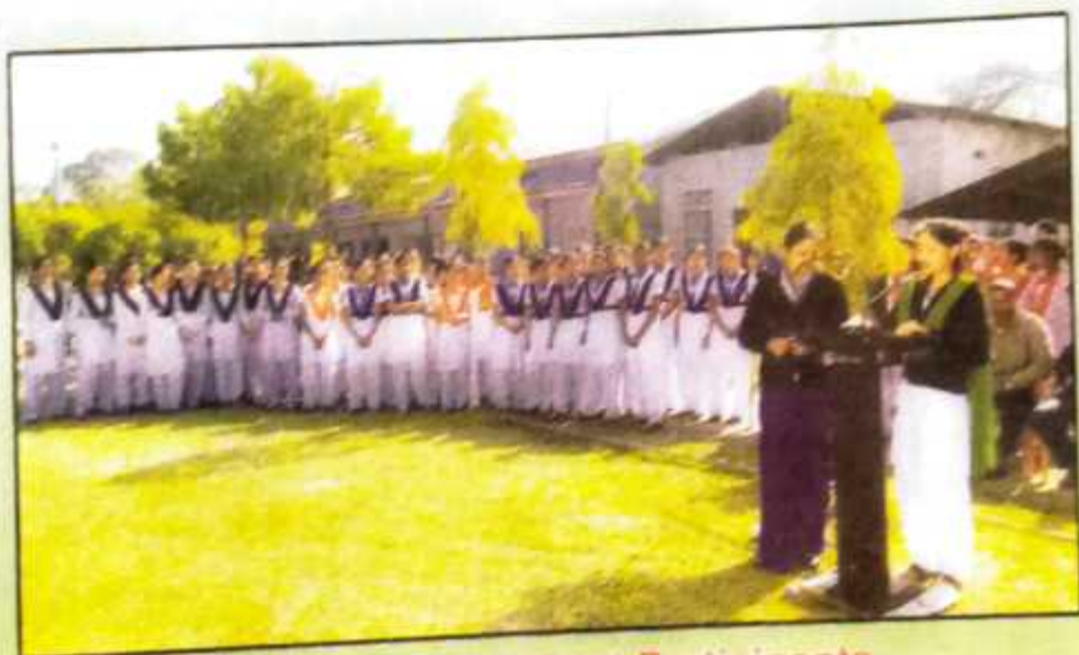
College March Past Participants