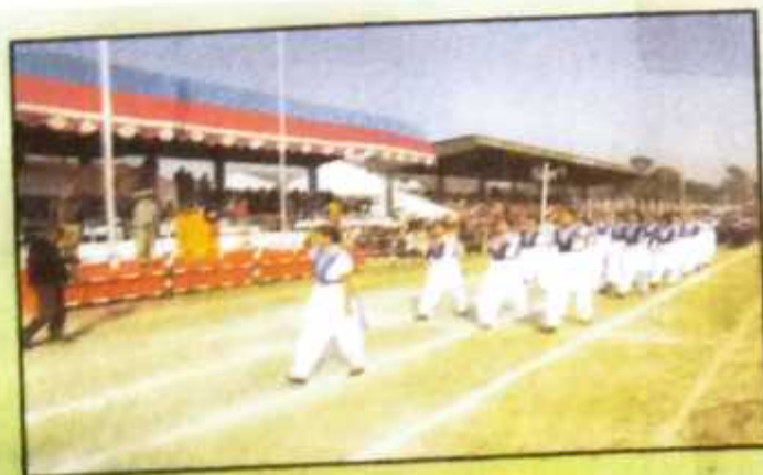
On Republic Day