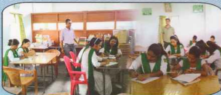
Essay Writing Competition held on 1st September, 2015 to mark the relevance of Teachers' Day.