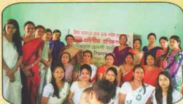
Training Programme on Cake & Paneer making (31st March, 2018) at Bam Hukuta