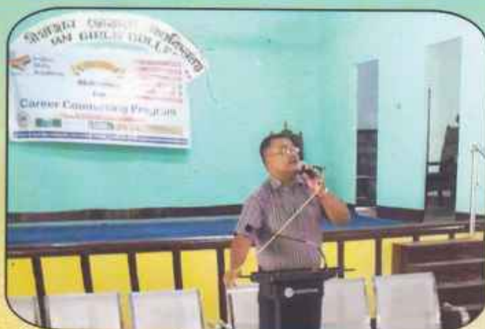
Indian Skills Academy (3rd August, 2018)