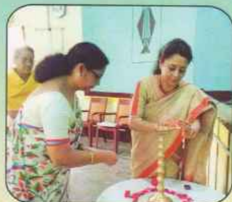
Talk on Adolescent Diseases (8th March, 2018)