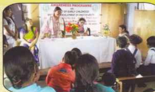
Awareness Programme Bamhukuta Pre-Primary School (24th March, 2018)