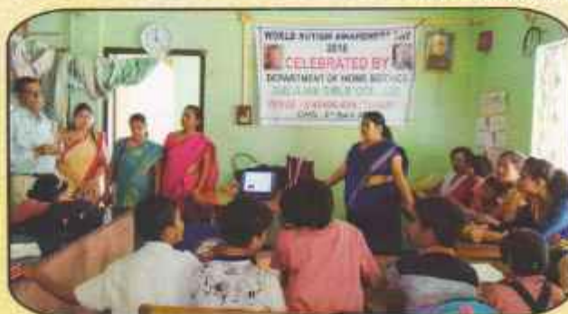
World Autism Awareness Day Celebration at Snehalaya, Tinsukia 2nd April, 2018