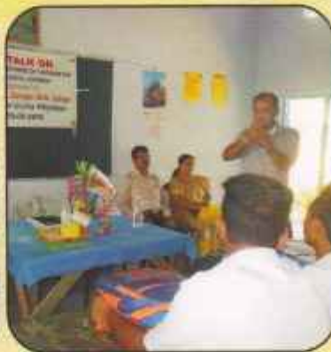
A talk on Effective Methods of Teaching for Successful Learning (29th May, 2018)