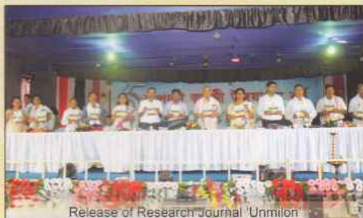
Release of Research Journal 'Unmilon'