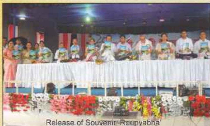
Release of Souvenir 'Roupyabha'