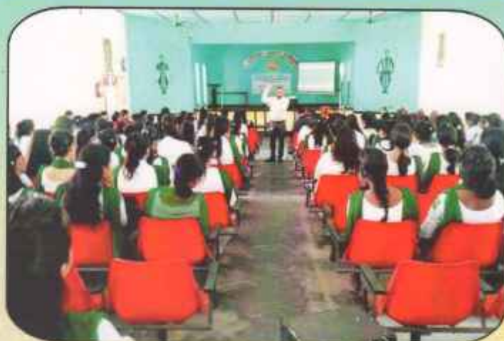
Brain Skills Development & Personality Development (23rd March, 2018)