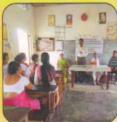
Importance of Women Education for Well being of Family and Society (25th May, 2018)