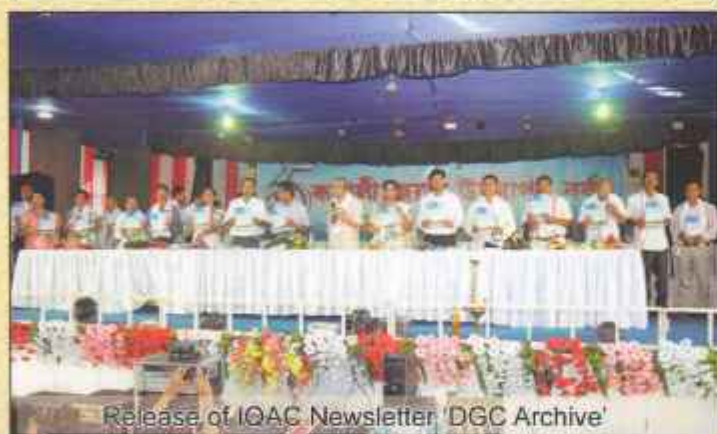
Release of IQAC Newsletter 'DGC Archive'